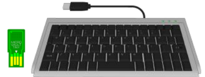
A USB keyboard and 2Gb USB memory key are supplied with the DMO200.